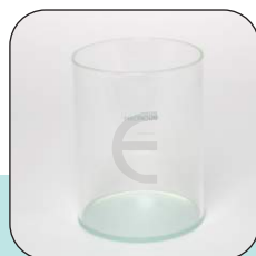
Glass beaker (1000 mL) Part no - 0213A00001