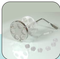
Six tube basket assembly with guided disc (Set of 2) for EDI-2 Part no - 0202A00009