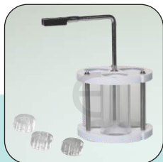
Three tube bolus basket assembly with guided disc (Set of 2) for EDI-2 Part no - 0202A00010