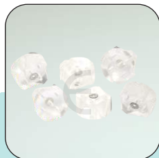
Magnetic guided disc (Set of 12) Part no - 0201A00007