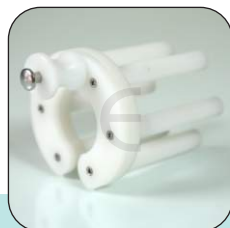
Disc handling device Part no - 0201A00018