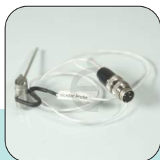
External temperature probe for EDI-2 Part no - 0213B00001