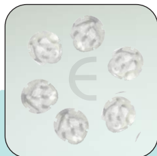
Guided disc for six tube basket assembly (Set of 6) Part no - 0201A00004