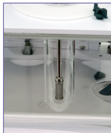
Model 2500 with Small Volume Basket