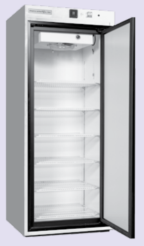
Model DROT33SD/TE Level 2

Options such as a temperature alarm, light dimmers, dual-point (day/night) temperature control, and extra shelves are popular.